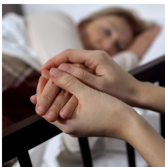
Living with Illness