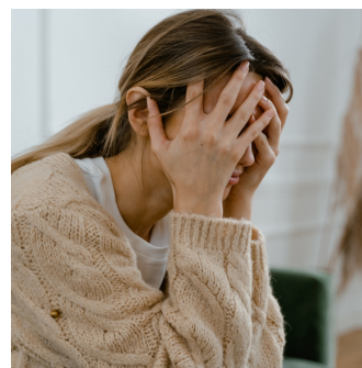
Coping with Grief

Follow us to stay updated with the latest news and events from Evergreen Hospice!