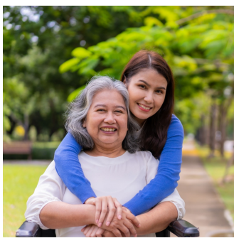
Care for Caregivers